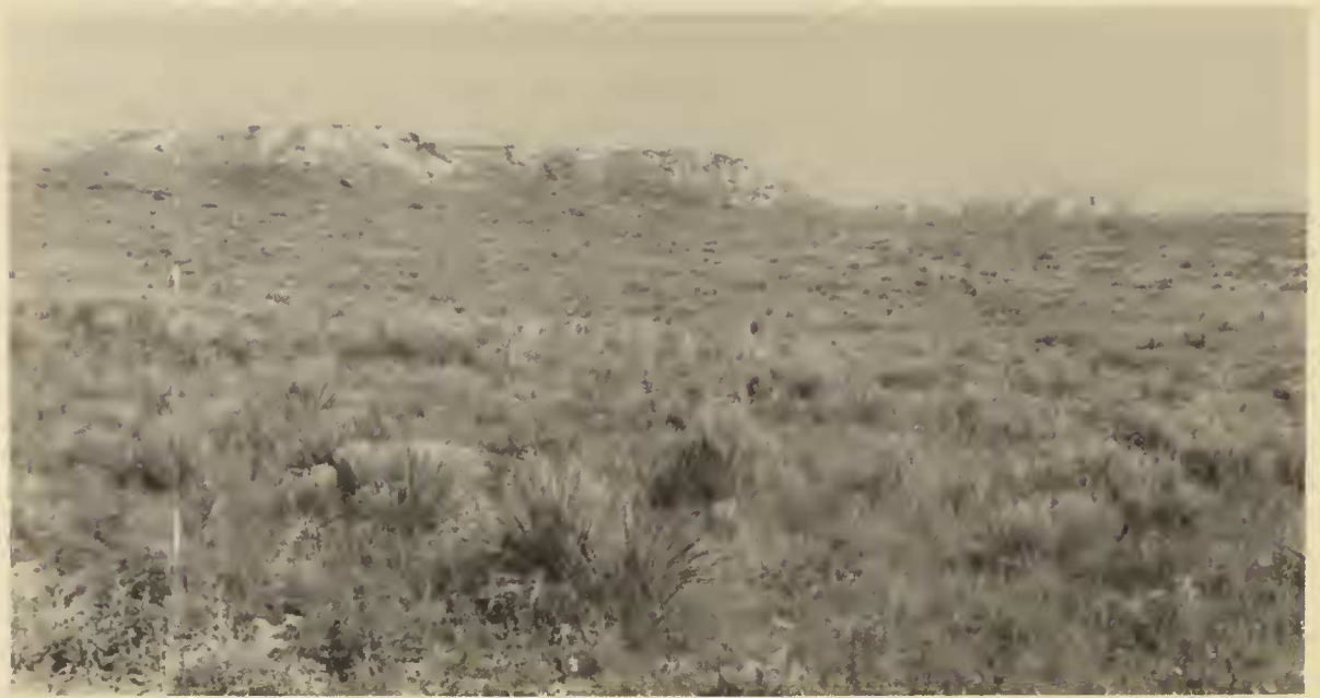
FIG. 5.—Rangeland west of Channing, Hartley County.